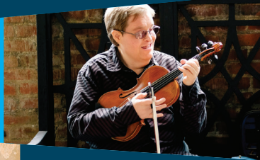
Shemekia Copeland Blues