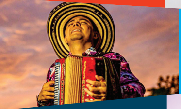
Mariachis Mariposas Texas Mariachis